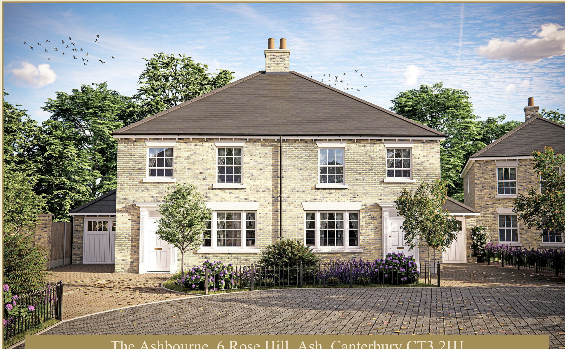
The Ashbourne, 6 Rose Hill, Ash, Canterbury CT3 2HJ